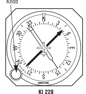
Slaved KI 228-01 shown. Standard KI 228-00 also available with manually rotatable compass card.